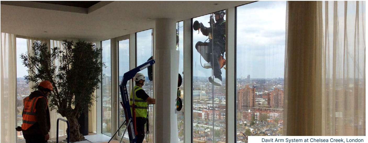
Davit Arm System at Chelsea Creek, London