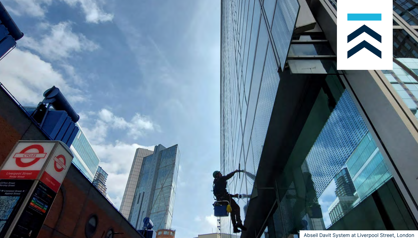
Abseil Davit System at Liverpool Street, London