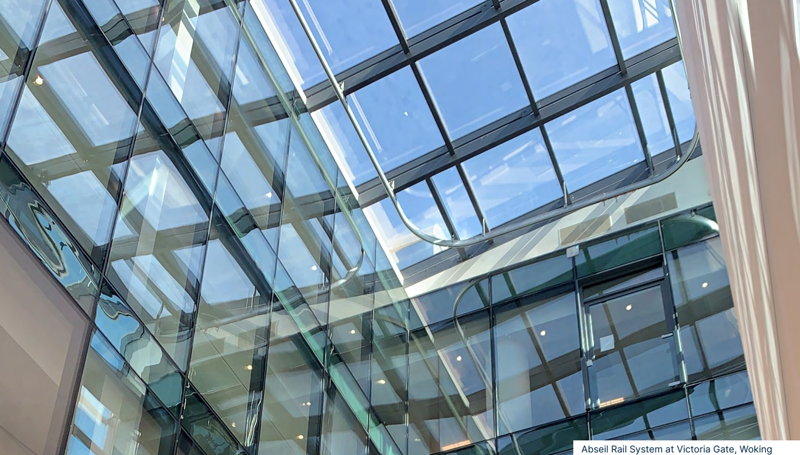
Abseil Rail System at Victoria Gate, Woking