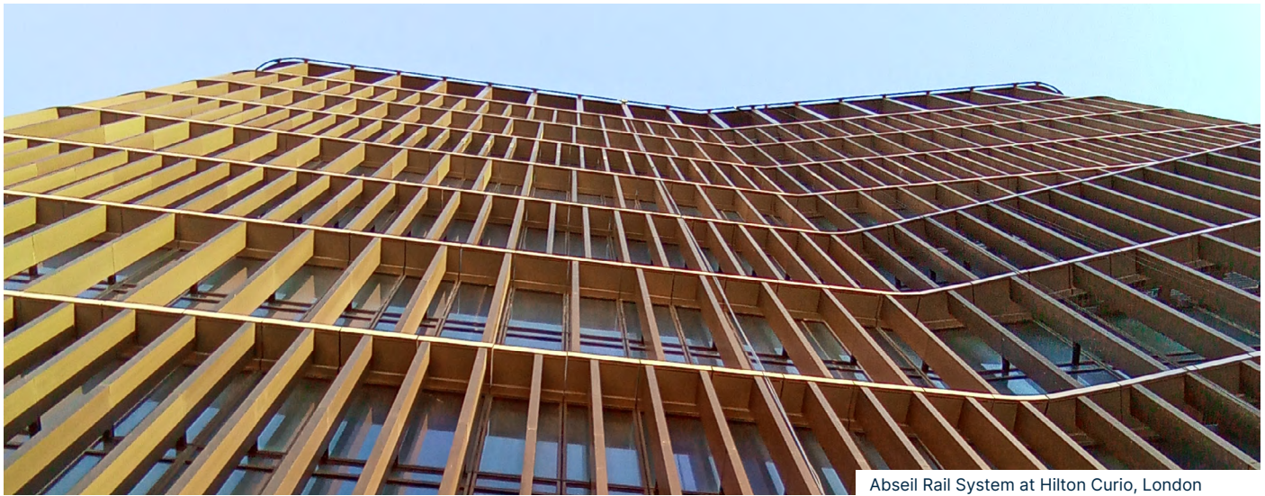
Abseil Rail System at Hilton Curio, London